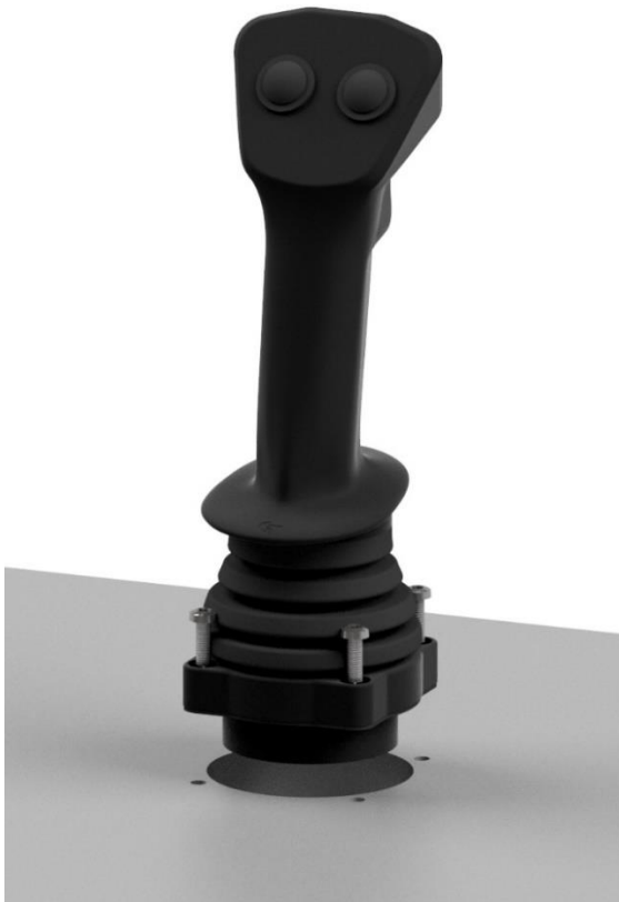
Exploded view of bottom mounted joystick